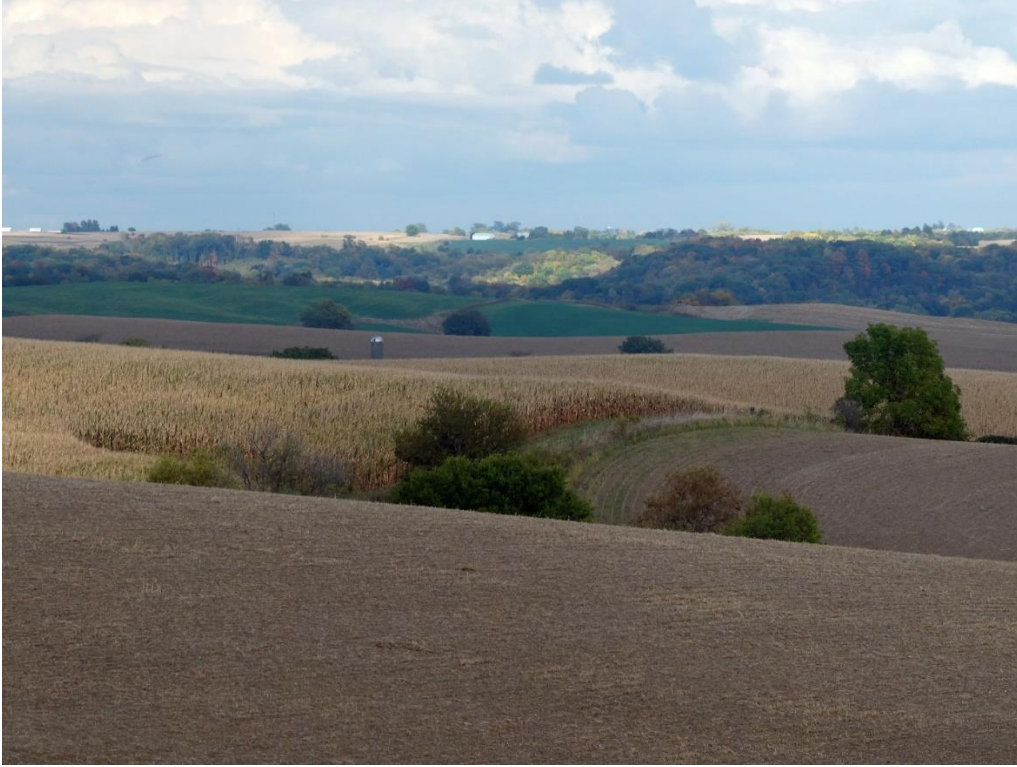
Looking out in the direction of the former Coffin, Stickler and Gilmore farms from Highway E29 near 120 th Street