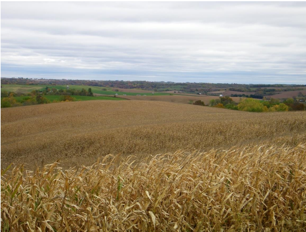
Looking out in the direction of the former Coffin, Stickler and Gilmore farms